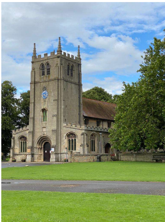
St Thomas à Becket Church, Ramsey