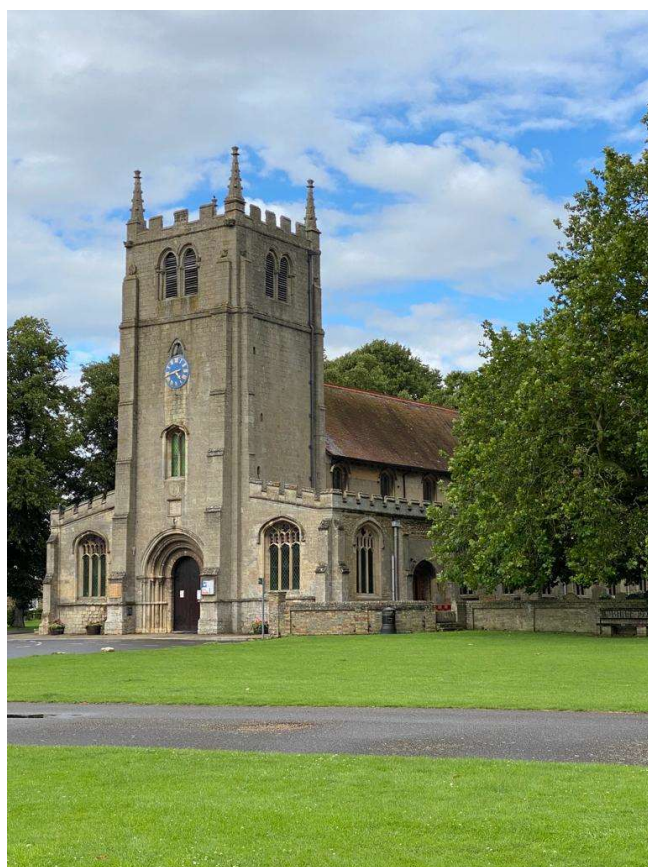
St Thomas à Becket Church, Ramsey